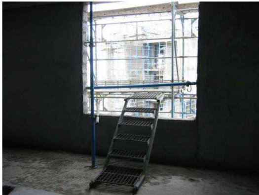
Proper Access to workplatform

All persons working on suspended scaffolds/cradles/gondolas must wear and use appropriate fall prevention equipment so as to protect them effectively at all times when they are at risk from any failure of any part of the scaffold/cradle/gondola, including its suspension system.