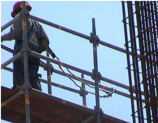
Full body harness with double lanyard

Guardrails are to be provided at all working places and other locations where persons or materials could fall more than 2.0m / 6'6". Where this can physically not be achieved, suitable and sufficient fall protection devices that do not rely on individuals should be provided and used to establish a safe place of work. (Examples include Safety Nets closely installed under height works, Stretched wire ropes installed to hook up safety harnesses while workers move from one location to another at height, Use of full body safety harnesses with double lanyards etc.)